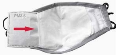
PM2.5 filter sheet